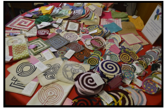
Finger Labyrinths for WELCA 2017 Triennial gathering in Minnesota in July