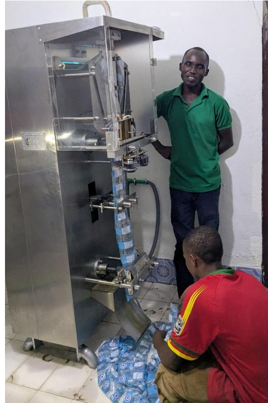
Water purification unit

Please, I would greatly appreciate if you can share any ideas about what you would like to read about in my newsletter. You are also welcome to write to me at any time or request any particular information about our mission work in West and central Africa you think I might have.