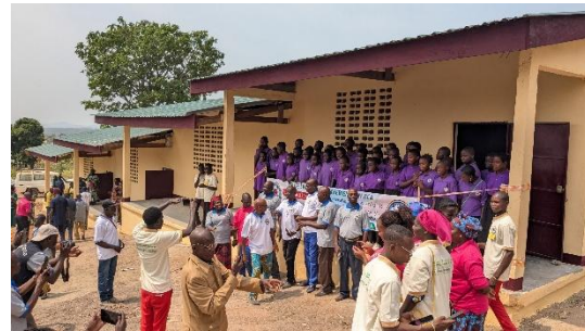
Protestant High School, Bouar-CAR

The Education Program of the ELC-CAR has been running community schools in 31 remote villages for 25 years providing opportunities for children in these communities to acquire basic education.